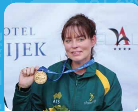
Four of MDQ's clients are now pursuing their Paralympic dreams thanks to our Sport and Recreation Program.