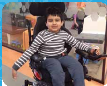
Each week MDQ's case workers assist families attending the Lady Cilento Hospital's Childrens' Neuromuscular Clinic.