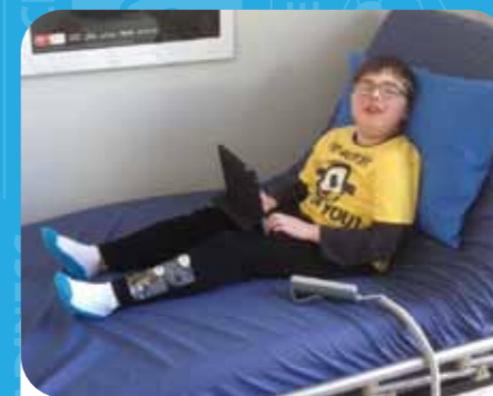
Independence, safety and comfort - the key outcomes for each person to benefit from MDQ's long term equipment loans.