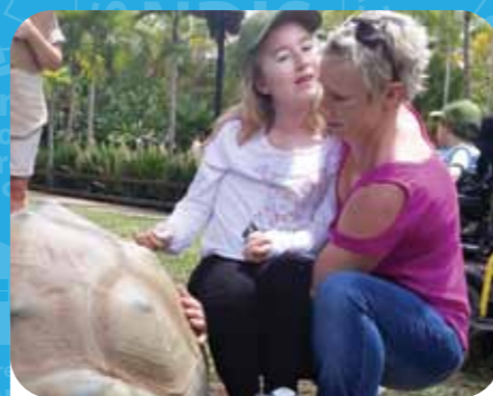
MDQ facilitates group activities to enable people living locally to connect and share experiences (like this day at Australia Zoo).