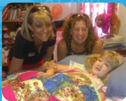
Through outreach, MDQ meets clients in regional areas, in their homes, learning about their lives, needs and goals.

Each year, families facing extreme hardship seek our support. Our crisis support program is funded solely through donations and allows Muscular Dystrophy Queensland to offer assistance when no other alternatives are available. Through the service this year, we provided groceries for a hungry family, paid electricity bills to keep power on for a child's medical equipment, covered petrol costs to help get kids to school and for an isolated, elderly lady whose only family lived in Switzerland, we provided an iPad which enables her to regularly keep in touch with them with no ongoing costs.