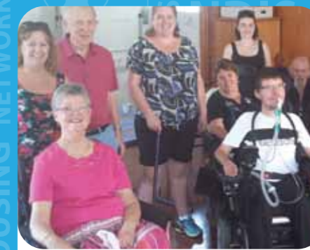
People connect, share their lives and experiences with others, through peer support groups facilitated by MDQ.